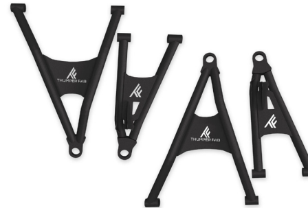
TRACKER 800SX HIGH CLEARANCE FORWARD FRONT CONTROL ARM SET