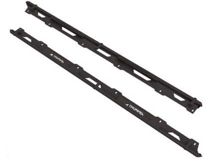
TRACKER 800SX NERF RAILS/ ROCK RAILS