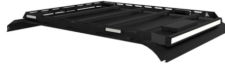
TRACKER 800SX ROOF WITH ROOF RACK-CREW

LIKE YOUR THUMPER FAB FRONT BASKET? CHECK OUT OUR OTHER AMAZING PRODUCTS FOR THE TRACKER OFF ROAD 800SX!