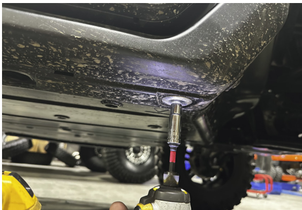
FIG 1 - Remove OEM Skid Plate fasteners (on both sides of vehicle)

Remove the 5 OEM skid plate bolts and washers on the driver and of the skid plate using a 10mm socket. Repeat the process for the passenger side ( FIG 1 ).