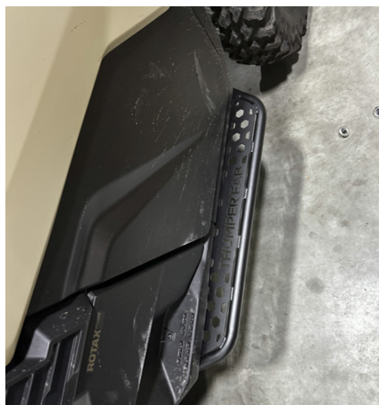
FIG 2 & FIG 3 - Mount Nerf Rails to vehicle and tighten