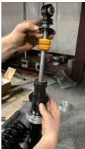
Fig 5 - Install spacer

You are now ready to place your shock back onto your vehicle in the reverse order they were removed be sure to torque all hardware and lug nuts to factory specs using your torque wrench ( FIG 6 ).