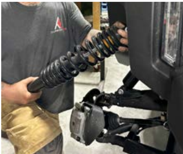
Fig 2 - Remove Shocks

Using a 16mm and 18mm sockets and wrenches remove the upper and lower shock bolts ( FIG 2 ).