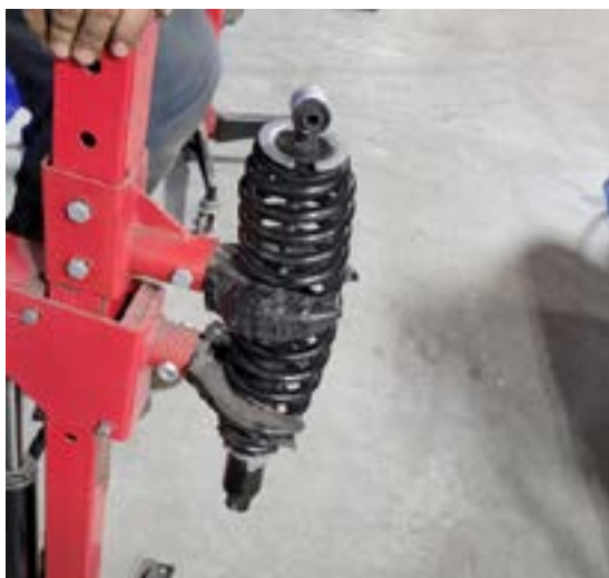
Fig 3 & Fig 4- Remove the spring from the shock