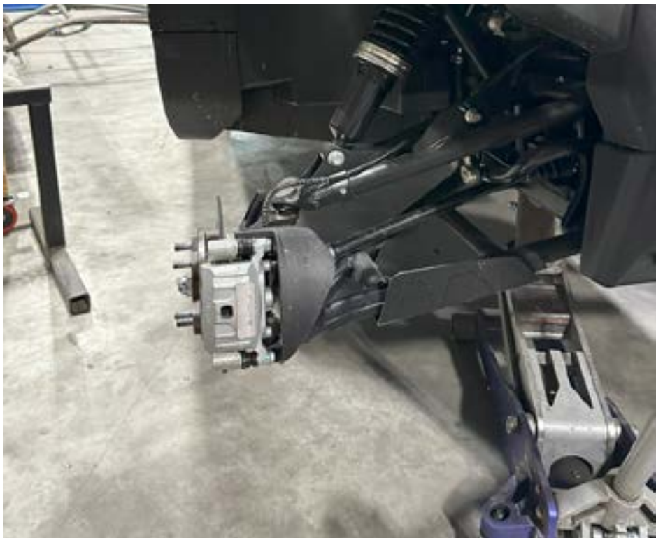
Fig 1- Remove Wheels

Place jacks under the vehicle and lift the unit high enough that the tire clears the ground, then place jacks under the frame of the vehicle. Now you can remove the tires with a 19mm socket and set aside ( FIG 1 ).