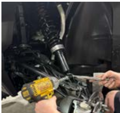
Fig 6 - Replace Shock Assemblies and reinstall wheels

You are now ready to place your shock back onto your vehicle in the reverse order they were removed be sure to torque all hardware and lug nuts to factory specs using your torque wrench ( FIG 6 ).