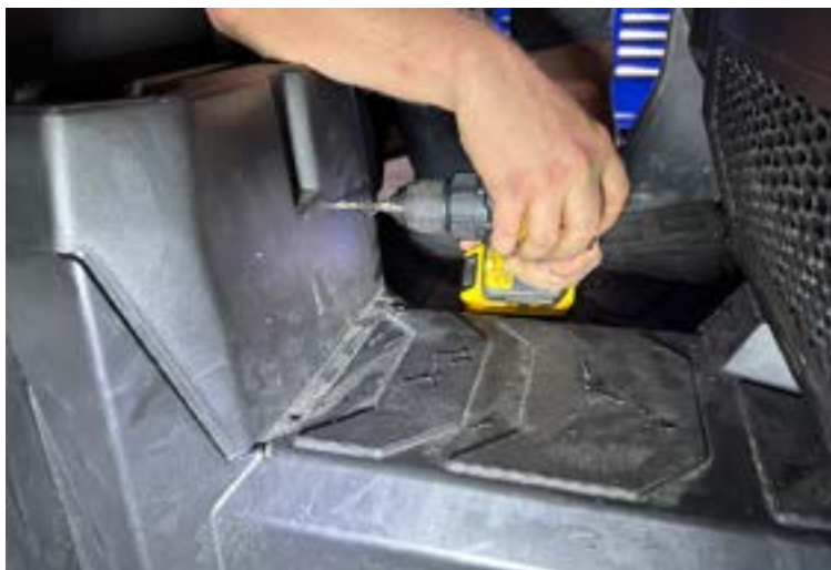
FIG 6 - Drill the marked holes using an 1/8" drill bit

Drill the marked holes using an 1/8" drill bit as a pilot hole ( FIG 6 ).