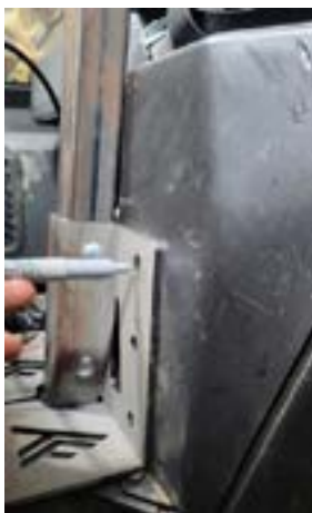
FIG 5 - Mark holes to be drilled using Attachment Plate as a template

Place the gun mount assembly in the center floorboard on the inside of the vehicle. Mount can be installed in either the front or rear passenger compartment. Mark the holes to be pre-drilled before mounting attachment plate to the vehicle ( FIG 5 ).