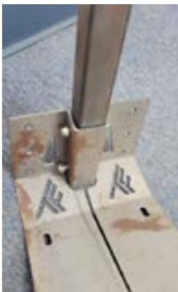
FIG 1 - Mount Adjustable Pole to Attachment Plate

Fasten the attachment plate to the adjustable pole using 2 X 1/4"x2" carriage bolts and 2 X 1/4" flange nylon lock nuts. Tighten with a 7/16" socket ( FIG 1 ).