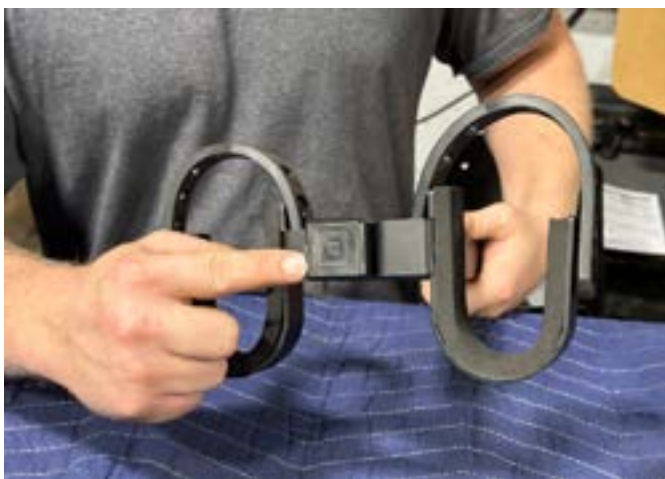
FIG 4 - Insert Square Tubing Plug in Adjustable Pole

Install square tubing plug in adjustable pole. It may help to use a rubber mallet to fully seat the tubing plug ( FIG 4 ).