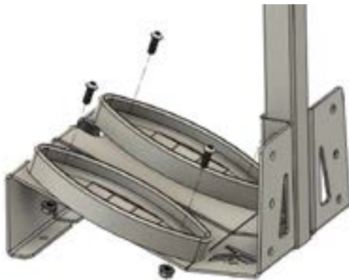
FIG 3 - Mount Gun Butts to the Attachment Plate

Fasten the 2 X gun butts to the attachment plate using 4 X 1/4"x3/4" button head screws and 4 X 1/4" flange nylon lock nuts. Tighten with a 7/16" socket and a 5/32" allen wrench ( FIG 3 ).