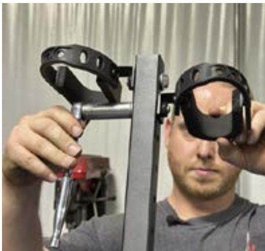
FIG 2 - Mount Gun Clamps to Adjustable Pole

Fasten the gun clamps to the adjustable pole using 2 X M10x50mm flange head bolts and 2 X M10 flange nylon lock nuts. Tighten using a 15mm socket and wrench ( FIG 2 ).