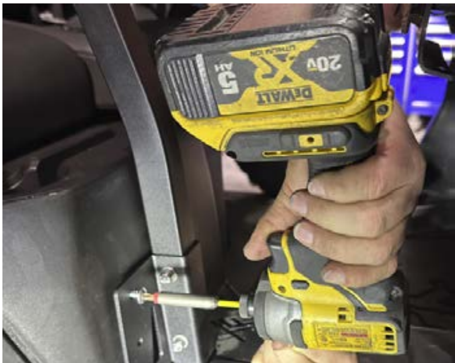
FIG 7 - Mount the Gun Mount Assembly to the Floorboard

Use the 8 X truss head screws to securely fasten the attachment plate to the floorboard of the vehicle ( FIG 7 ).