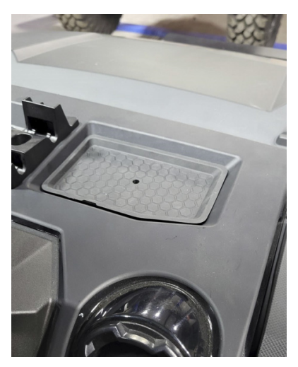
FIG 1 - Remove rubber cover using a flat head screwdriver

Remove rubber cover by pulling up with hands or a flat head screwdriver (FIG 1).