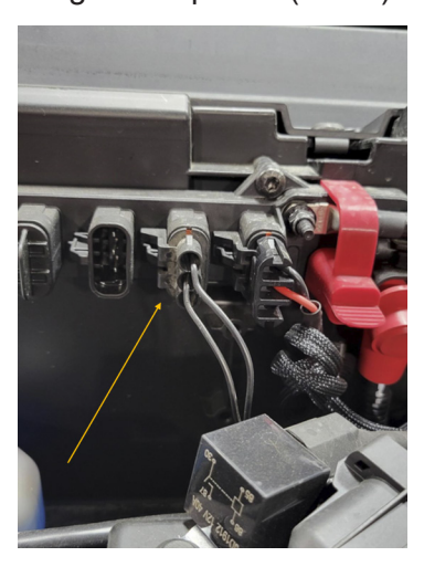
FIG 8 - Connect wiring harness to the pulse bar

If instaling the wireless phone charger, route the wiring harness (2) under the dash and into the hood. Connect the pigtail to the pulse bar to supply the phone charger with power (FIG 8).