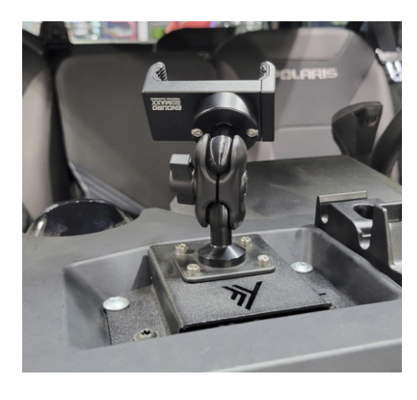
FIG 6 & 7 - Fasten phone charging unit / phone mount to ball mount using the adjustable swivel mount

If instaling the wireless phone charger, route the wiring harness (2) under the dash and into the hood. Connect the pigtail to the pulse bar to supply the phone charger with power (FIG 8).