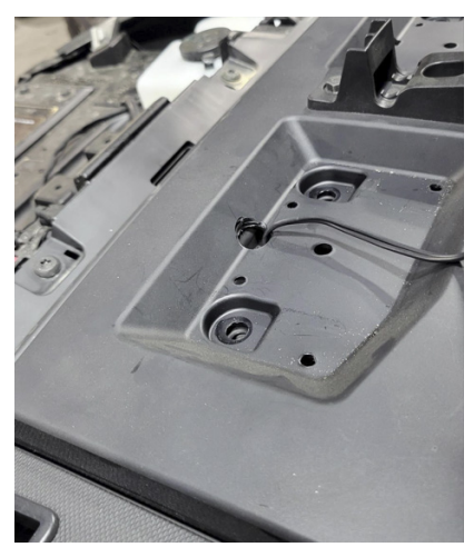
FIG 2 - Drill Hole for wires to run through using 5/8" drill bit

If installing the wireless phone charger, use a 5/8" drill bit to make a hole for the wire to run through. Once drilled, feed wire through dash ( FIG 2 ).