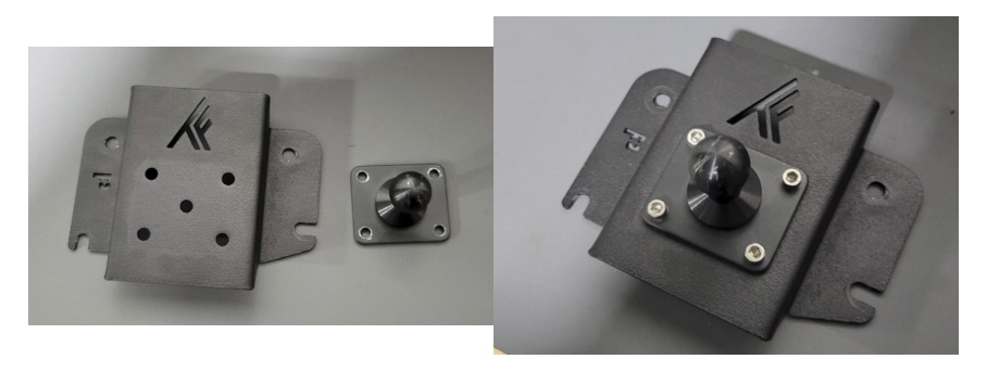
FIG 3 & 4 - Mount ball mount to mount bracket using 9/64" Allen and 11/32" Wrench

Fasten the ball mount (4) the dash mount bracket (1) using the 4 x #8 socket cap screws ( D ), 4 x #8 nylon lock nuts ( C ). Tighten using the 9/64" allen and 11/32" wrench ( FIG 3 & FIG 4 ).