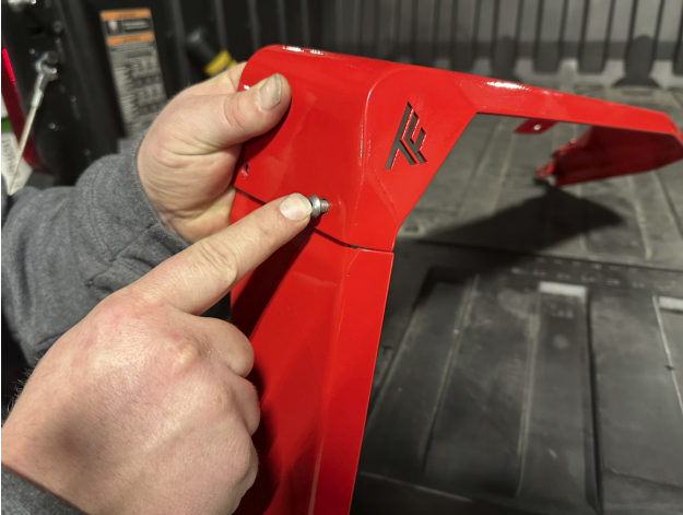
FIG 1 - Fasten Front Fender Flares together

Fasten the front upper and lower fender flare together using 4 x 1/4" x 3/4" button head screws, and 4 x 1/4" nylon lock nuts ( FIG 1 ).