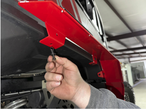
FIG 5 - Fasten Fender Flares to Vehicle

Use panel clips to fasten the fender flares to the vehicle by feeding the clips through the fender flares into the drilled holes ( FIG 5 ).