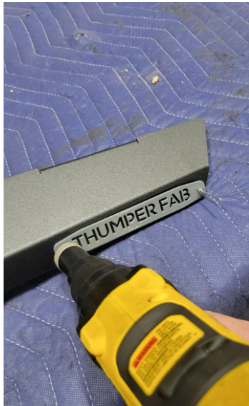
FIG 6 - Fasten Logo Plates to Rear Upper Fender Flares

Fasten the logo plates to the rear upper fender flare using 4 x 1/8" rivets ( FIG 6 ).