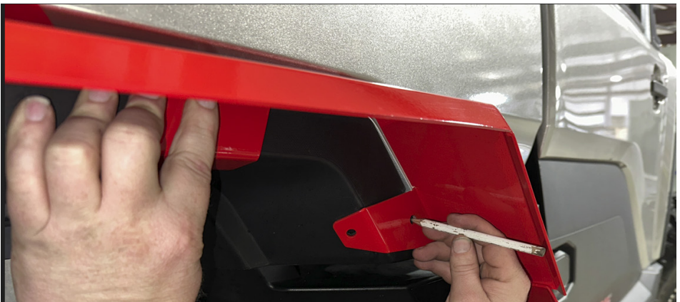
FIG 4 - Use Rear Fender Flares as a template to mark holes

Use the rear upper and rear lower fender flares as templates to mark the holes to be drilled using a marker or pencil. Make sure that the fender flares are sitting in the desired position before marking of the holes to be drilled (FIG 4).