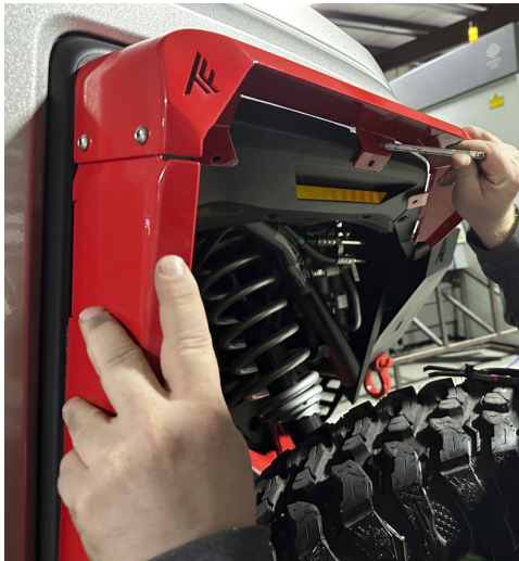
FIG 2 - Use Front Fender Flare as a template to mark holes

Use the front fender flare as a template to mark the holes to be drilled using a marker or pencil. It may help to have a second person hold the fender flare in position to make sure that the fender flare is sitting in desired position before marking the holes to be drilled ( FIG 2 ).