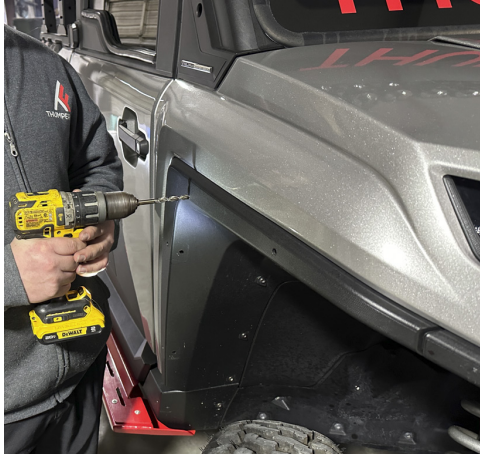
FIG 3 - Drill Holes using 5/16" Drill Bit

Use a 5/16" drill bit to drill holes that were marked in previous step (FIG 3).