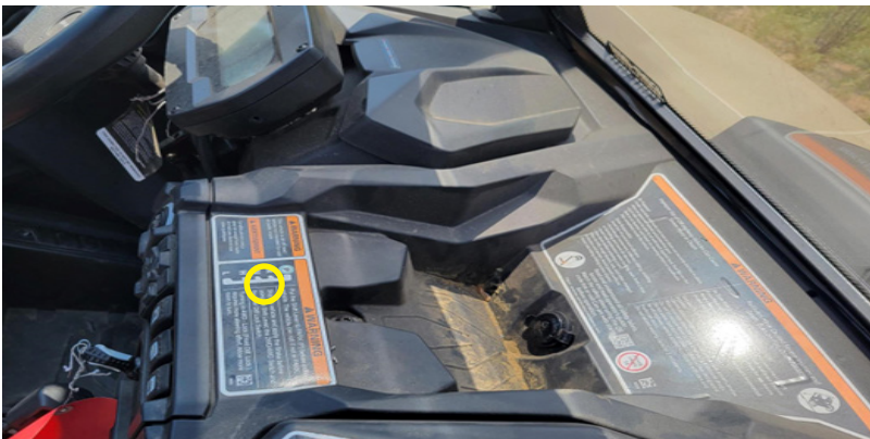
FIG 2 - Use 1/2" Drill Bit to drill hole in dash for wires to run through

Use the 1/2" Drill Bit to drill a hole for the phone charger (3) wires to run through the dash in the spot shown below in yellow. Mark hole using wire hole in phone charger mount bracket as template (FIG 2).