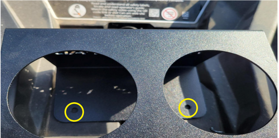
FIG 3 - Use a Drill with a Phillips Head Drill to fasten Mount Bracket to unit

Place the phone charger mount bracket in position on the dash, use the 1/8" drill bit to drill pilot holes for mounting screws. Use the 2 x #14 x 3/4" truss head philips screws (A) and the drill with a phillips head attachment to fasten the mount bracket to the unit (FIG 3).