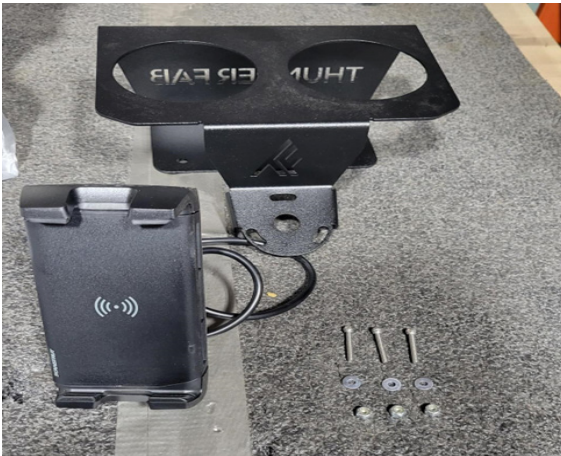
FIG 1 - Use 7/64" Allen and 5/16" Socket to mount Phone Charger to Mount Bracket

Before installation of the phone charger mount bracket (1) on the unit, mount the wireless phone charger (3) to the mount bracket (1) using the 3 x #6-32 x 3/4" socket cap screws (B) along with the #6-32 nylon lock nuts (C) and #6 flat washers (D). Use the 5/16" socket and the 7/64" allen to tighten the mounting hardware fastening the phone charger (3) to the mount bracket (1) (FIG 1).