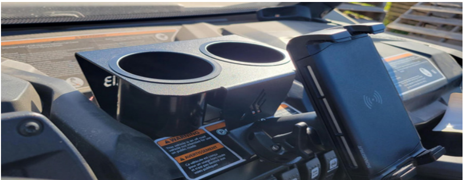
FIG 4 - Insert Cupholders (2) into Mount Bracket (1)

Place the cupholders (2) into mount bracket (1) holes. O rings (E) have been provided to be placed over cupholders (2) before being inserted into mount bracket (1) to reduce vibration if desired. Refer to wiring instructions inside wireless phone charger box (FIG 4).