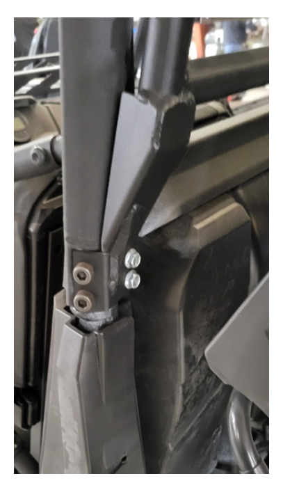
FIG 4 - Thread in M10-1.25 x 60mm socket cap screws using 8mm Allen Wrench