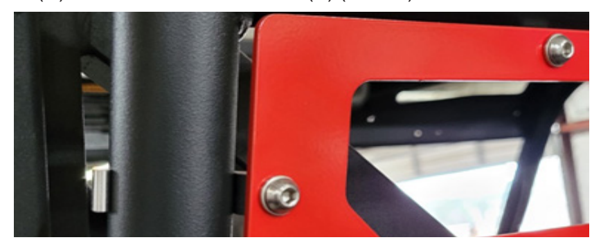
FIG 11 - Install Rear Window Cover 5/32" Allen Wrench

Attach rear window cover plate using 8 \times 1/4 "- 20 \times .5 " button head screws ( R ) and 8 \times 1/4 " lock washers ( S ) ( FIG 11 ).