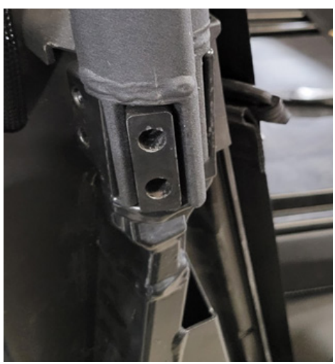
FIG 2 - Place Spacer