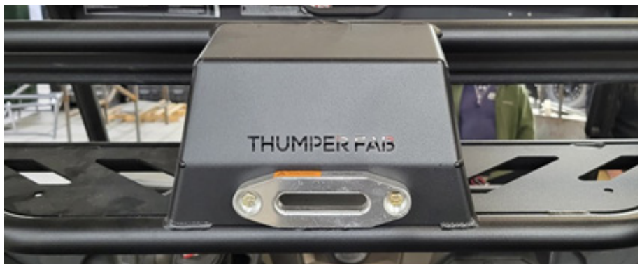
FIG 6 - Install Fairlead using 5/32" Allen Wrench and 7/16" Wrench

Fasten the Fairlead to the Winch Cover Plate using 2 \times 1/4 "-20 x 1" socket cap screw ( G ) with 2 \times 1/4 " flat washers ( I ) and 1/4"-20 lock nuts ( H ) ( FIG 6 ).