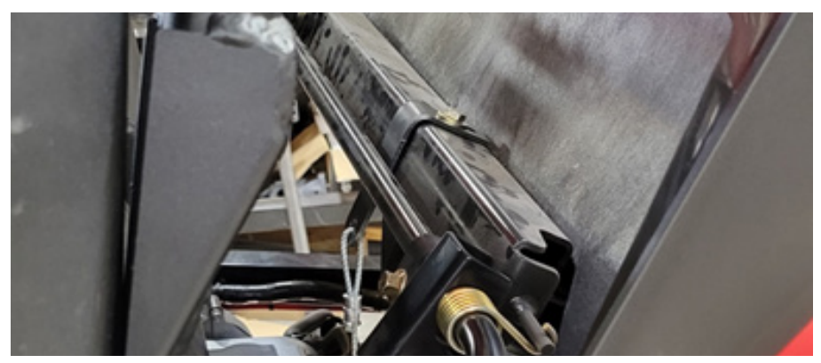
FIG 8 - Install Retention Cable Mount Bracket using 7/16" Socket and 7/16" Wrench

Secure Retention Cable Mount with attached cable to dump bed frame rail using supplied 1/4"-20 x 1" hex bolt ( G ) with 2 x 1/4" flat washers ( I ) and the 1/4"-20 lock nut using 7/16" socket and 7/16" wrench ( FIG 8 ).