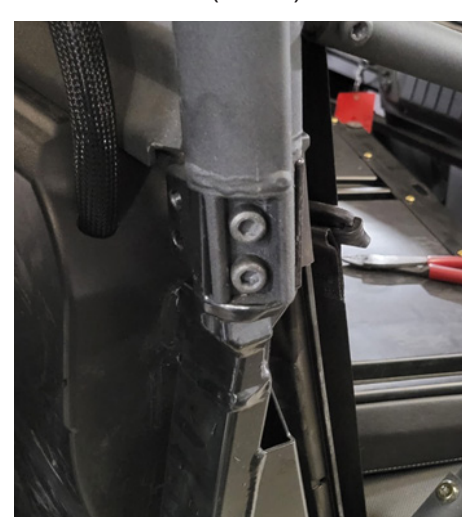
FIG 1 - Remove Lower Stock Bolts (8mm Allen Wrench)

Lift the bed of the unit so that it is in the dump position. Locate and remove the 4 \times M10-1.25 socket cap screws that fasten the rear of the roll cage to the frame of the unit using a 8mm allen ( FIG 1 ). Be careful to hold the M10-1.25 lock nut on the back side during removal as these lock nuts will be reused in the installation of the headache rack. Place spacers in void in roll cage mount created by removing the stock hardware below ( FIG 2 ).