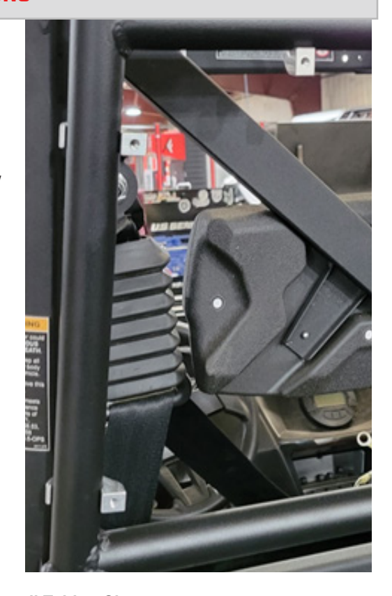
FIG 10 - Install Tubing Clamps

Snap 8 x 1-1/4" tubing clamps ( Q ) around tubing of headache rack using holes in rear window cover ( P ) to locate clamp location.( FIG 10 ).