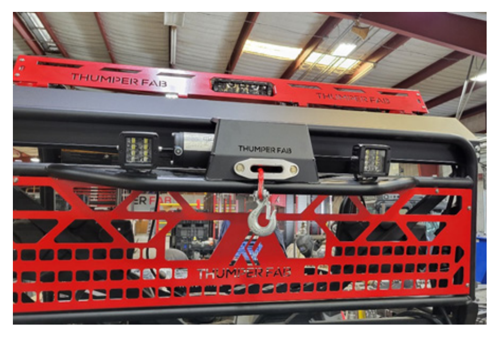
FIG 12 - Install Cube Lights

Fasten cube lights to winch mount plate using hardware and brackets supplied in cube light box ( FIG 12 ).