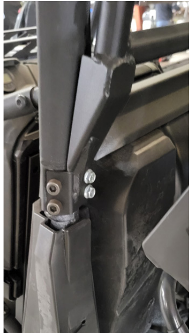
FIG 5 - Thread and tighten lower bolts using 13mm Socket