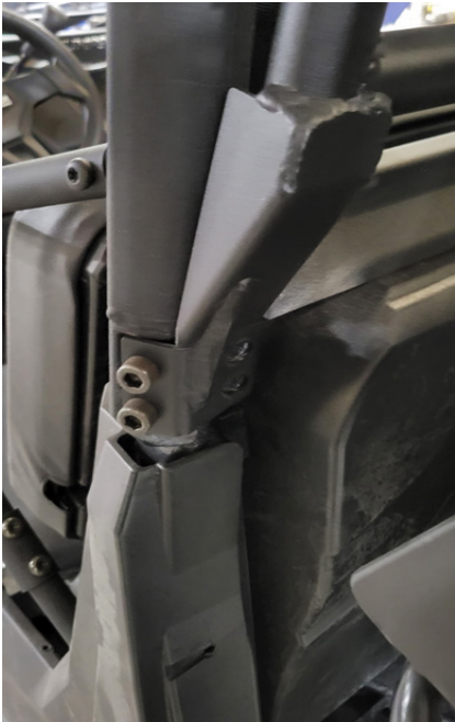
FIG 4 - Thread in M10-1.25 x 60mm socket cap screws using 8mm Allen Wrench

Install the remaining 4 x M8-1.25 lock nuts (E) inside the slots in the bungs in the lower portion of the cage (FIG 5). Using the 13mm socket tighten the lower 4 x M8-1.25 x 20mm flange bolts (D) while holding the M8-1.25 lock nuts (E) in place. Tighten remaining upper and lower mounting bolts evenly until tight.