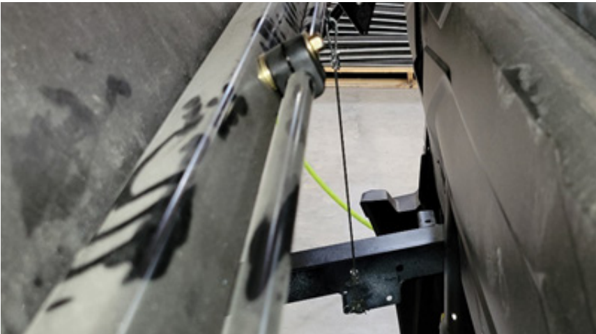
FIG 9 - Install Retention Cable Frame Mount

Fasten the opposite end of the retention cable to the frame rail of the unit using the 5/16" clevis pin (N) with 2 x 5/16" flat washers (O)(FIG 9).