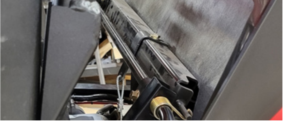
FIG 8 - Install Retention Cable Mount Bracket using 7/16" Socket and 7/16" Wrench

Secure Retention Cable Mount with attached cable to dump bed frame rail using supplied 1/4"-20 x 1" hex bolt (G) with 2 x 1/4" flat washers (I) and the 1/4"-20 lock nut using 7/16" socket and 7/16" wrench (FIG 8).