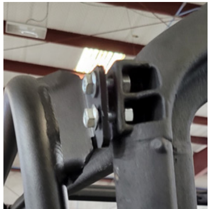
FIG 3 - Position Headache Rack & Install Top Bolts

Place the headache rack into position and insert the 4 x M8-1.25 lock nuts ( E ) inside slots in the bungs in the top of cage. Thread in by hand the M8-1.25 x 25mm flange bolts ( C ) to hold the top of the headache rack ( FIG 3 ). DO NOT FULLY TIGHTEN.