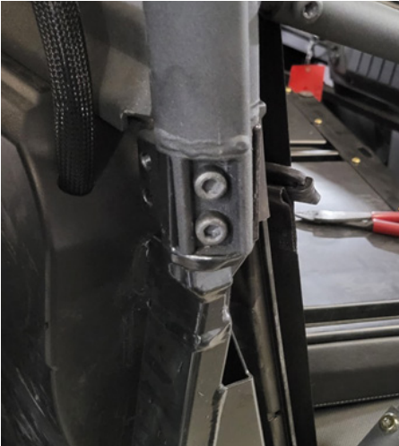
FIG 1 - Remove Lower Stock Bolts (8mm Allen Wrench)

Lift the bed of the unit so that it is in the dump position. Locate and remove the 4 x M10-1.25 socket cap screws that fasten the rear of the roll cage to the frame of the unit using a 8mm allen ( FIG 1 ). Be careful to hold the M10-1.25 lock nut on the back side during removal as these lock nuts will be reused in the installation of the headache rack. Place spacers in void in roll cage mount created by removing the stock hardware below ( FIG 2 ).