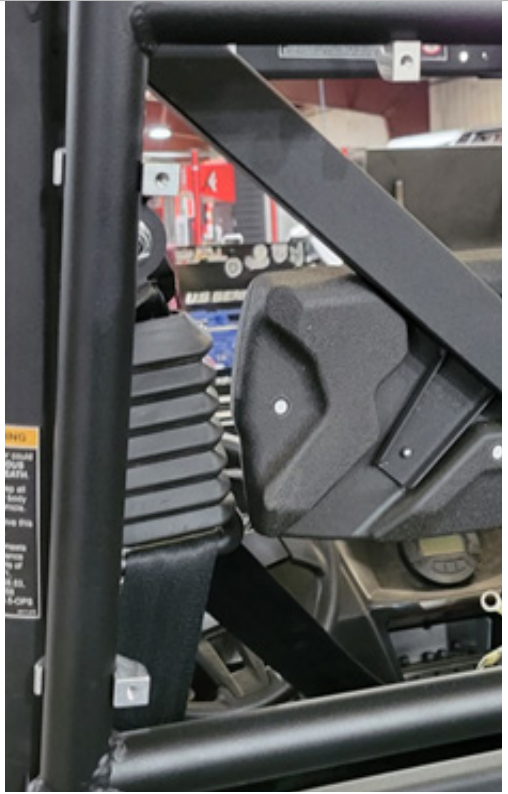
FIG 10 - Install Tubing Clamps

Snap 8 x 1-1/4" tubing clamps (Q) around tubing of headache rack using holes in rear window cover (P) to locate clamp location.(FIG 10).