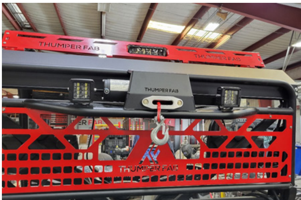
FIG 12 - Install Cube Lights

Fasten cube lights to winch mount plate using hardware and brackets supplied in cube light box ( FIG 12 ).