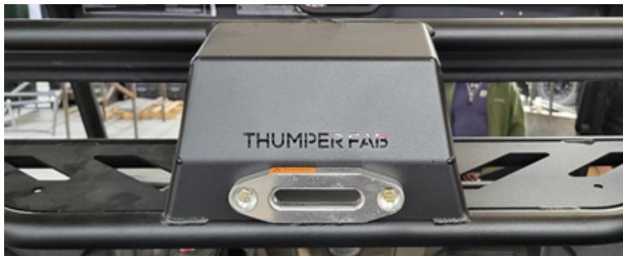
FIG 6 - Install Fairlead using 5/32" Allen Wrench and 7/16" Wrench

Fasten the Fairlead to the Winch Cover Plate using 2 x 1/4"-20 x 1" socket cap screw ( G ) with 2 x 1/4" flat washers ( I ) and 1/4"-20 lock nuts ( H ) ( FIG 6 ).