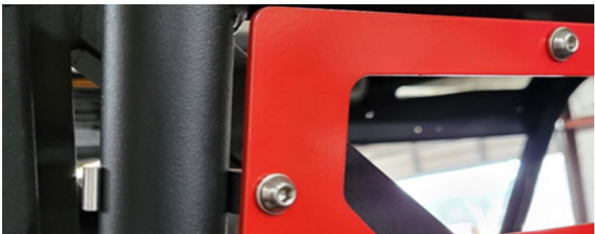
FIG 11 - Install Rear Window Cover 5/32" Allen Wrench

Attach rear window cover plate using 8 x 1/4"-20 x .5" button head screws (R) and 8 x 1/4" lock washers (S) (FIG 11).