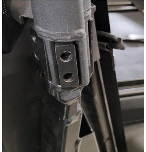
FIG 2 - Place Spacer