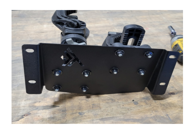
FIG 1 & FIG 2- Attach gun mounts to plate using 7/16" Socket