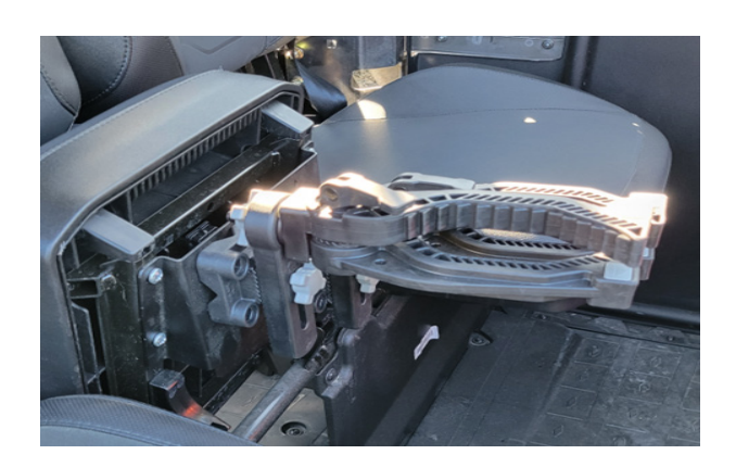
FIG 3 & FIG 4 - Using #3 Phillips Bit and Drill attach Plate to underside of Seat