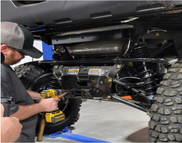
FIG 1 - Use 3/16" Drill bit to drill out rivets

Jack up the unit and remove the wheels. Use the drill and a 3/16" drill bit to drill out the rivets fastening the factory rear chassis cover to the frame ( FIG 1 ).