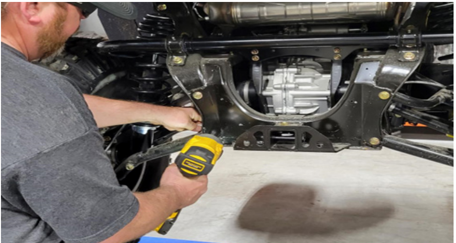
FIG 2 - Use 15mm Socket and 15mm Wrench to remove OEM bolts

Use the 15mm socket and the 15mm wrench to remove the factory hardware the bolts the rear most control arm bushing of the upper and lower control arm to the frame ( FIG 2 ).