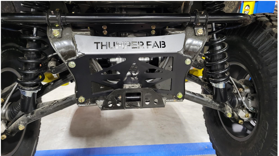
FIG 3 - Use 15mm Socket and 15mm Wrench to fasten stiffener to frame.

Fasten the Rear Chassis Stiffener (1) to the rear of the frame using the 2 x M10-1.5x80mm flange head bolts (A) in the top 2 holes and the 2 x M10-1.5x85mm hex head bolts (B) and 2 x M10 flat washers (D) in the bottom 2 holes. Use the 4 x M10-1.5 flanged nylon lock nuts (C) to tighten hardware to factory specifications (FIG 3).