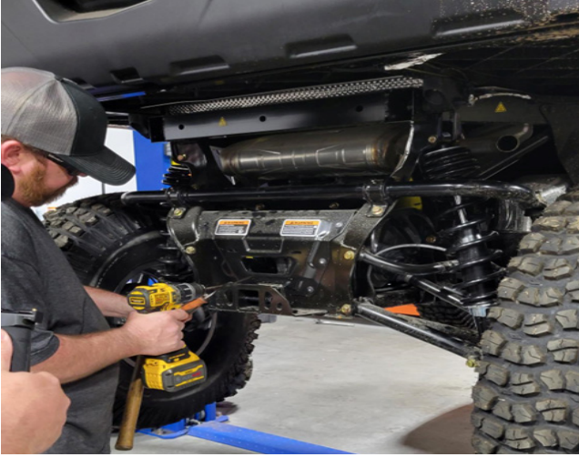
FIG 1 - Use 3/16" Drill bit to drill out rivets

Jack up the unit and remove the wheels. Use the drill and a 3/16" drill bit to drill out the rivets fastening the factory rear chassis cover to the frame ( FIG 1 ).