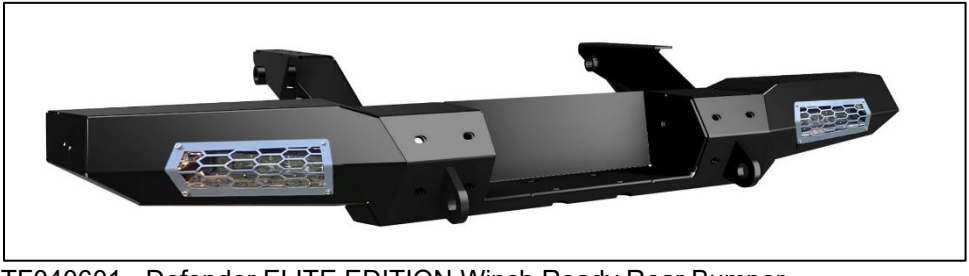
TF040601 - Defender ELITE EDITION Winch Ready Rear Bumper