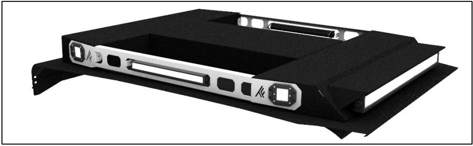
TF040310 - Defender (MAX) Level 5 Audio Roof