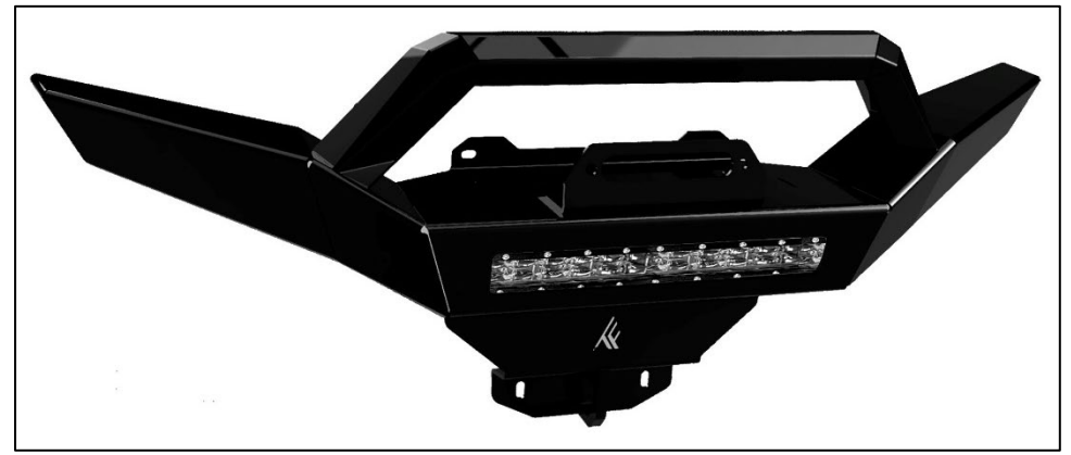
TF040501 - Defender Front Winch Bumper