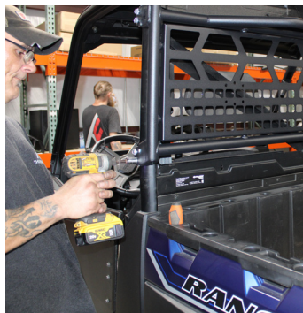
FIG 6 - Fasten Headache Rack Bolts using 13mm Socket