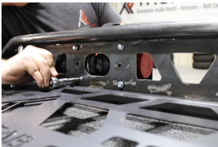
FIG 4 - Fasten Winch to Winch Base Plate with 10mm Socket

Fasten the winch to the winch base plate 4 x M6-1.0 x 20mm flange bolts ( D ) along with M6 lock washers ( E ) using 10mm socket ( FIG 4 ).