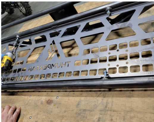
Fig 1 - Install Accent Panel onto Headache Rack with 13mm Socket

Fasten the accent panel to the headache rack using 8 X M8-1.25 x 25mm flange bolts (C). Tighten evenly with 13 mm socket (FIG 1).