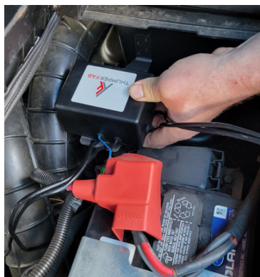
FIG 8 - Fasten winch contactor to inside of battery box using supplied bracket