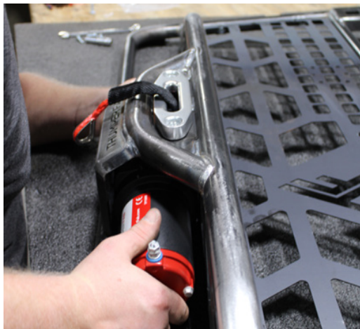
FIG 3 - Thread Winch Cable through Fairlead

Run winch cable through hole in winch cover plate and through fairlead to prepare to fasten the winch to the winch base plate. Be careful not to pinch cable ( FIG 3 ).