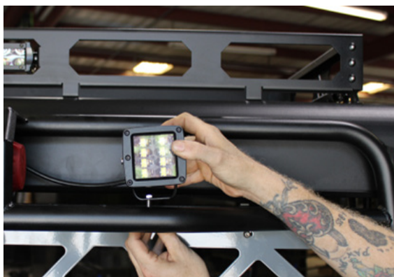
FIG 9 - Fasten Cube Light to Winch Cover Plate

Attach cube lights to the winch mount plate using the hardware provided in the cube light box and wire using supplied harness ( FIG 9 ).