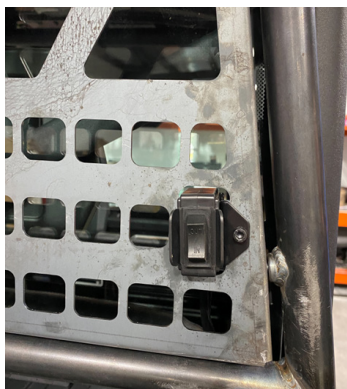
FIG 7 - Fasten switch to accent panel

Please refer to wiring instruction contained in the winch box for complete detailed instructions for proper wiring of winch. Mount the remote switch for the winch to the accent panel ( FIG 7 ). The winch contactor can be mounted in the battery box using supplied bracket using 3 x 1/4"-20 x 3/4" socket cap screws ( F ) and 3 x 1/4"-20 lock nuts ( G ) and 2 zipties ( H ) ( FIG 8 ). Note: Install vehicle used was a 2021 Ranger XP1000, wire routing may vary for different Ranger submodels.