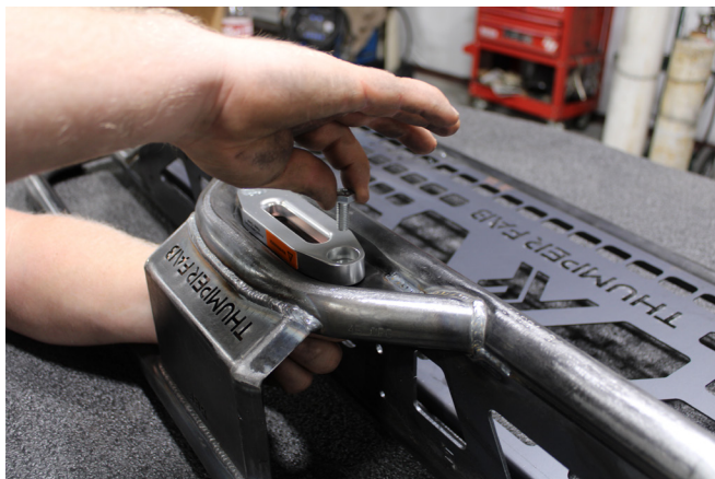
Fig 2 - Fasten fairlead to Headache Rack with 13mm Socket

Remove the fairlead from supplied box and slide it into place under the winch cover plate bull bar. Use the 2 short M8x1.25 bolts, M8 lock washer, and M8x1.25 nuts supplied in winch box along with 13mm socket and 13mm wrench to fasten fairlead to headache rack (FIG 2).