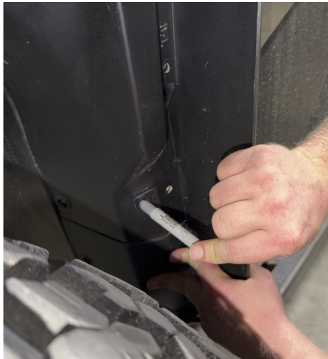
FIG 2 - Mark the holes for the front fender flares

Use the front fender flares as a template to mark the mounting holes on the plastic, once satisfied with the positioning of the flare. It may help to have a second pair of hands to properly position the fender flare before marking the holes ( FIG 2 ).