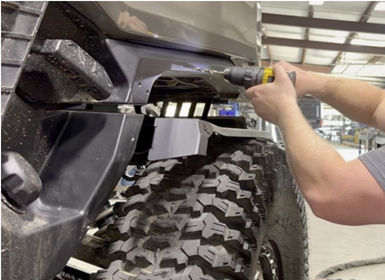
FIG 6 - Drill rear fender flare mounting holes

Drill the marked holes for the rear fender flares using a 5/16" drill bit. Be careful not to drill deeper than needed ( FIG 6 ).