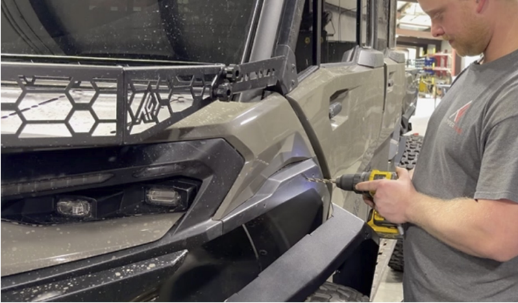
FIG 3 - Drill marked holes for front fender flares

Drill the marked holes using a 5/16" drill bit. Be careful not to drill deeper than required to make it all the way through the plastic ( FIG 3 ).