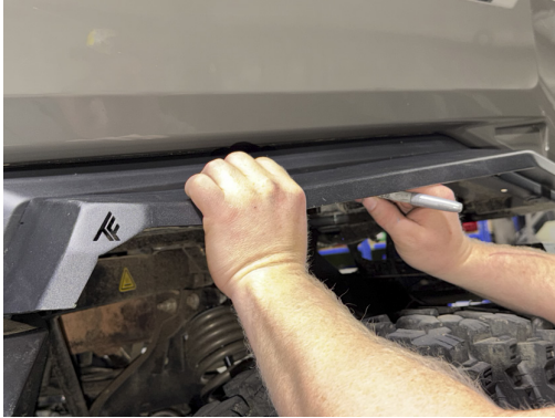
FIG 5 - Mark holes for rear fender flares

Repeat the process for the rear fender flares. Hold both the rear upper and rear lower fender flares in position up against the vehicle (place the upper fender flare over the lower fender flare so the bed can open once installed). Once satisfied with the positioning, mark the holes to be drilled using a sharpie ( FIG 5 ).