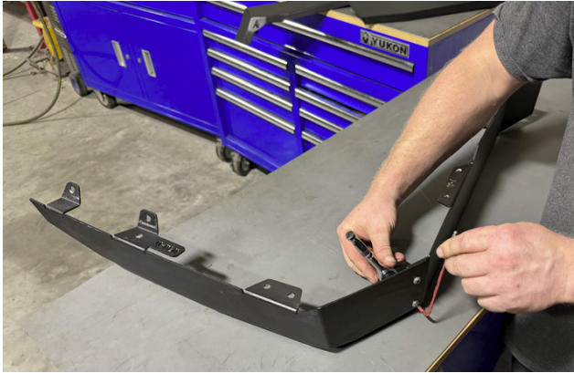
FIG 1 - Fasten the front fender flares together

Begin by fastening the front upper fender flare to the front lower fender flare using 4 x 1/4"x3/4" button head screws and 4 x 1/4" nylon lock nuts. Tighten using a 5/32" allen wrench and a 7/16" socket ( FIG 1 ).