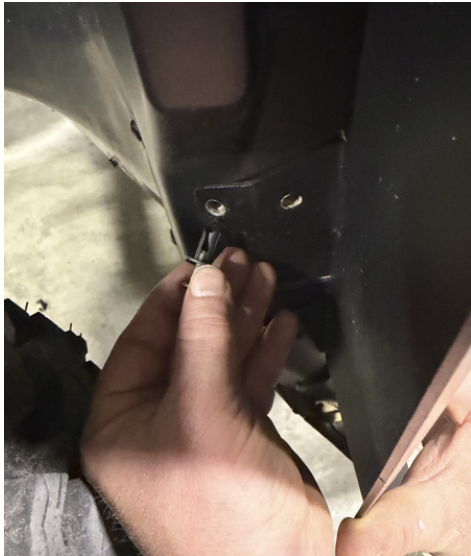
FIG 4 - Mount front fender flares to the vehicle

Fasten the front fender flare to the vehicle using a UTV Fender Clip in each mounting hole ( FIG 4 ).