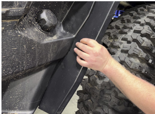
FIG 7 - Fasten the rear lower fender flare to the vehicle

Fasten the rear lower fender flare to the vehicle using the UTV fender clips ( FIG 7 ).