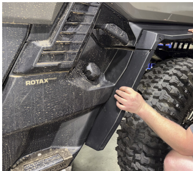
FIG 8 - Fasten the rear upper fender flare to the vehicle

Fasten the rear upper fender flare to the vehicle using the UTV fender clips ( FIG 8 ).