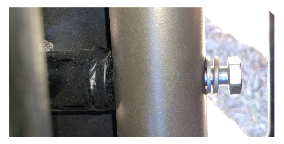
FIG 5 - Bolt and Washer Sequence (17mm Wrench)