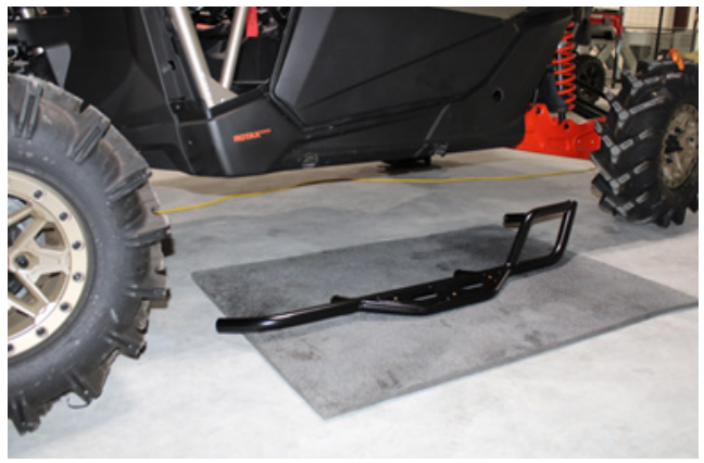
FIG 4 - Stage for Nerf Rail Installation

Place nerf rail on appropriate side for installation. Align the nerf rail with the cut out holes ( FIG 4 ). Use a 17mm wrench and the M10 hardware ( A ) to loosely fasten the rail to the unit using the middle hole first ( FIG 5 ). The hardware should run M10-1.5 x 70mm cap screws (A) \rightarrow lock washer (C) \rightarrow fender washer (B) \rightarrow frame tube \rightarrow nerf rail threaded tube end . There will be 3 points where the rail is loosely attached (tighten 3-4 threads) to the unit, one assembly at each hole. Attach to middle hole 1st (access inside cab), rear hole 2nd (access from inside cab) & front hole 3rd (access from underneath * FIG 3 *).