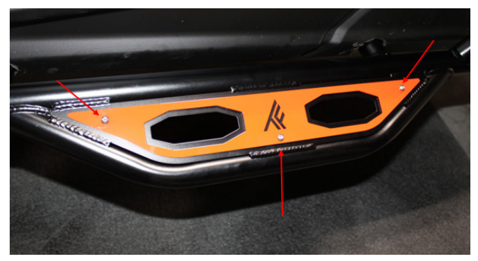
FIG 8 - Install Accent Panels (3/32" Allen Wrench)

Use the 6 x #8-32 x 1/2" bolts ( D ) to install the accent panels ( 3,4 ) to the nerf rail step plates ( 1,2 ) using 3/32" allen wrench ( FIG 8 ). The bolts will thread into rivnuts on the nerf rails. Cap each end with a plastic plug ( E ).