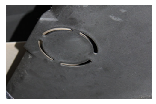
FIG 2 - Cut Out Plastic

Adjusting the seats forward or backward will help with install. Locate the circular breakout hole on the inside of the lower side panel (rear most hole). Use the utility knife to cut the tabs and remove the plastic hole cover ( FIG 2 ).