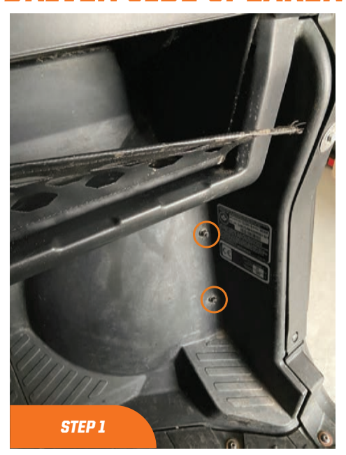
Remove the factory nuts in these two locations