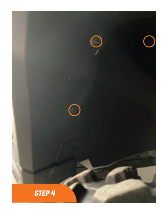
Once all 3 holes are aligned, use the (2) two M6x20 bolts and washers in the factory hole locations and (1) one M6x16 bolt and washer in the drilled hole location to secure the pod to the vehicle. Hand tighten all bolts.