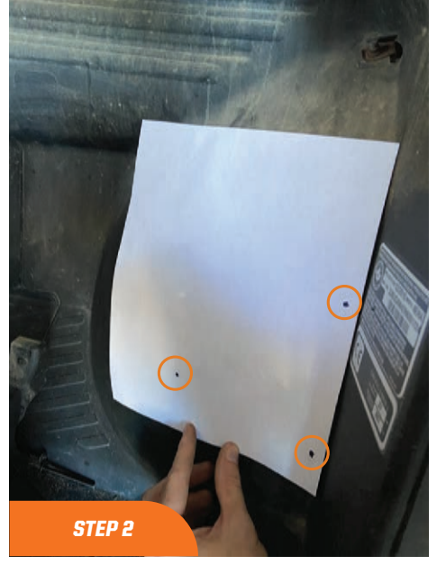
Align the template with the factory hole locations then mark the additional hole location with a scribe tool.