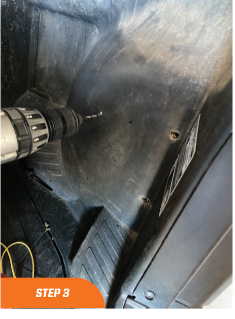
Drill a 5/16" hole in the marked location. Place the speaker pod in the kick panel location and align the threaded inserts on the back of the pod with these 3 holes.