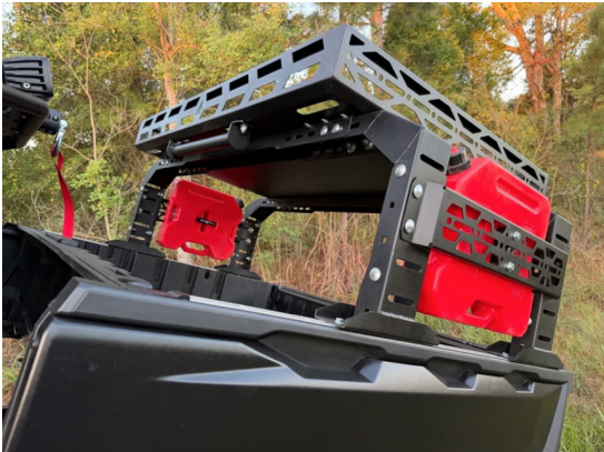
FIG 2 - Test the winch functionality and ensure no contact from winch rope to bed rack occurs

Fully tighten the hardware fastening the winch support bar to the basket of the adjustable bed rack. Once fully tight, test the winch with the bed in the dumped position to make sure winch rope does not contact the bed rack. Winch rope should contact underside of winch support bar ( FIG 2 ).