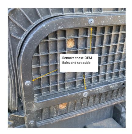
FIG 3 - Remove OEM Bolts using a T25 Torx

Remove the 3 OEM Torx bolts under the passenger seat using a T25 Torx and set them aside as they will be used to mount the gun mount mount plate (2) (FIG 3).