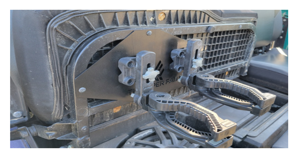
FIG 4 - Fasten Mount Plate to Seat Frame using OEM Bolts and a T25 Torx

Fasten the mount bracket (2) to the underside of the passenger seat using the 3 x T25 Torx screws removed in the previous step. Adjust the clamps as needed for optimal fitment and operation for your desired application ( FIG 4 ).